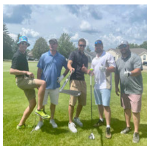
Hockey Stick Putter