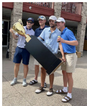
Foursome Champions 'Grip It and Sip It'