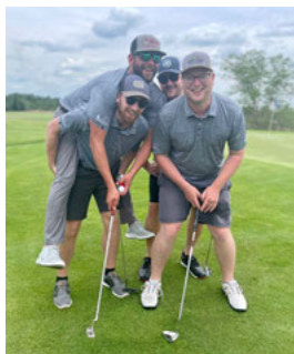
Boyz Havin Fun